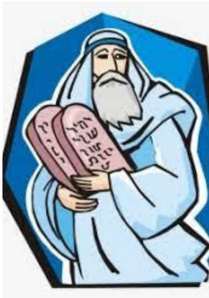
The law of the Lord is perfect, refreshing the soul ~ Ps 19:8

these conferences, especially if you are planning on attending the Holy Week liturgies or would like to learn more about the history and spirituality of the Holy Triduum, the three holiest days of the Church year.